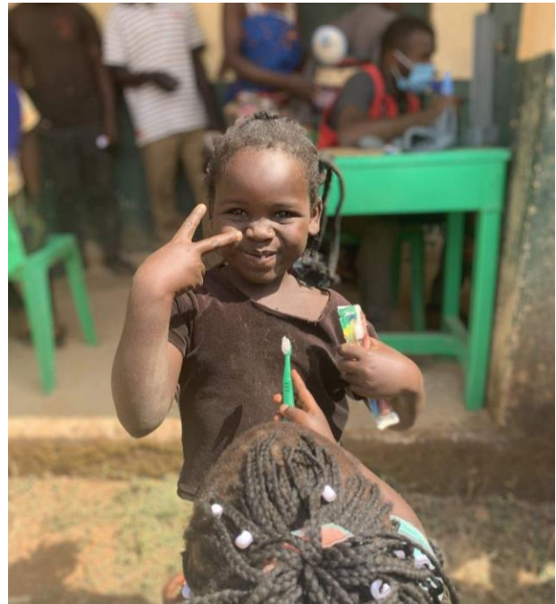
Fig 1-3: Images from the Clean and Healthy Me held on the 5 th of January