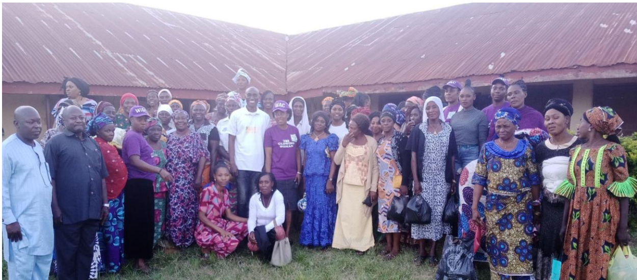
Fig 46: Image of the Widows Outreach held on the 9 th of October

We got in partnership on the 9 th of October, 2022 with Women Aglow Connect , a platform that focuses on women. This outreach was held at Solution Arena, Prestige Hall behind the College of Health Zawan. We had prayer and talk sessions with them and it was impactful. We provided a few items like rice, maggi, and spaghetti, as well as some clothes and shoes, including detergent and toiletries to fifty-one (51) widows.