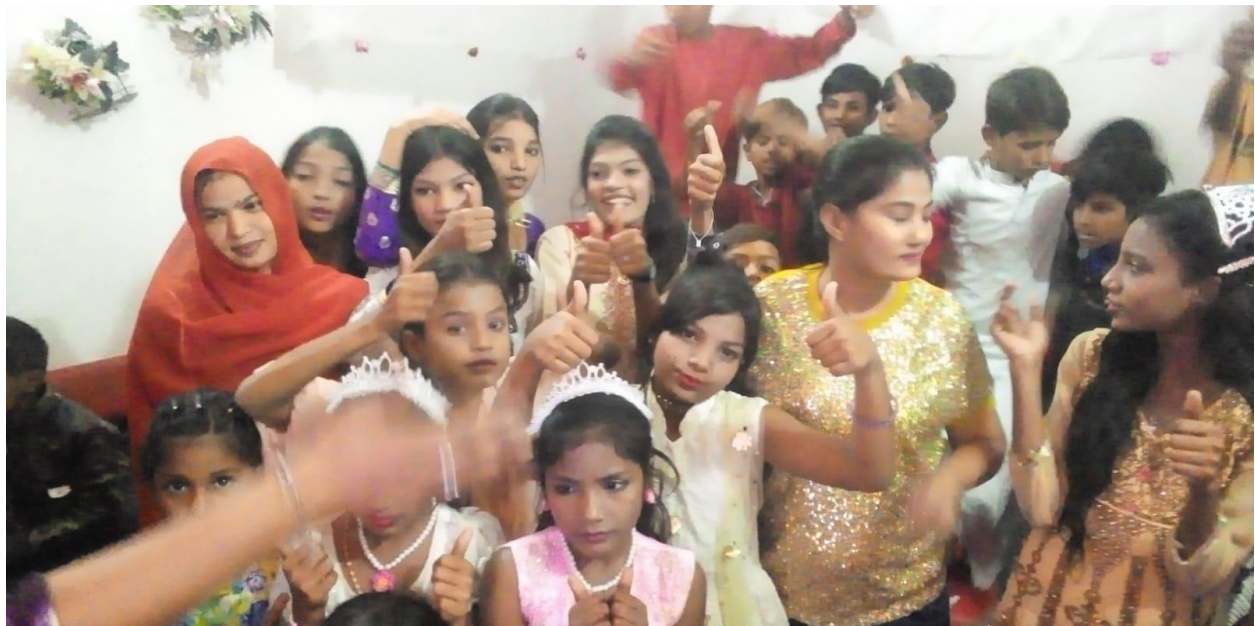
Fig 60-66: Images of the various Christmas gathering from the different Branches