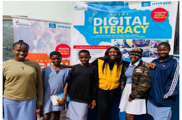
Fig 19-22: Images from the UNESCO Project from the 26 th of May - the 2 nd of June