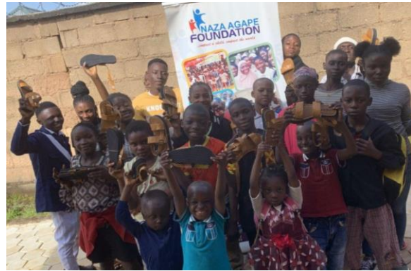
Fig 24-25: Images from the Monthly Lessons