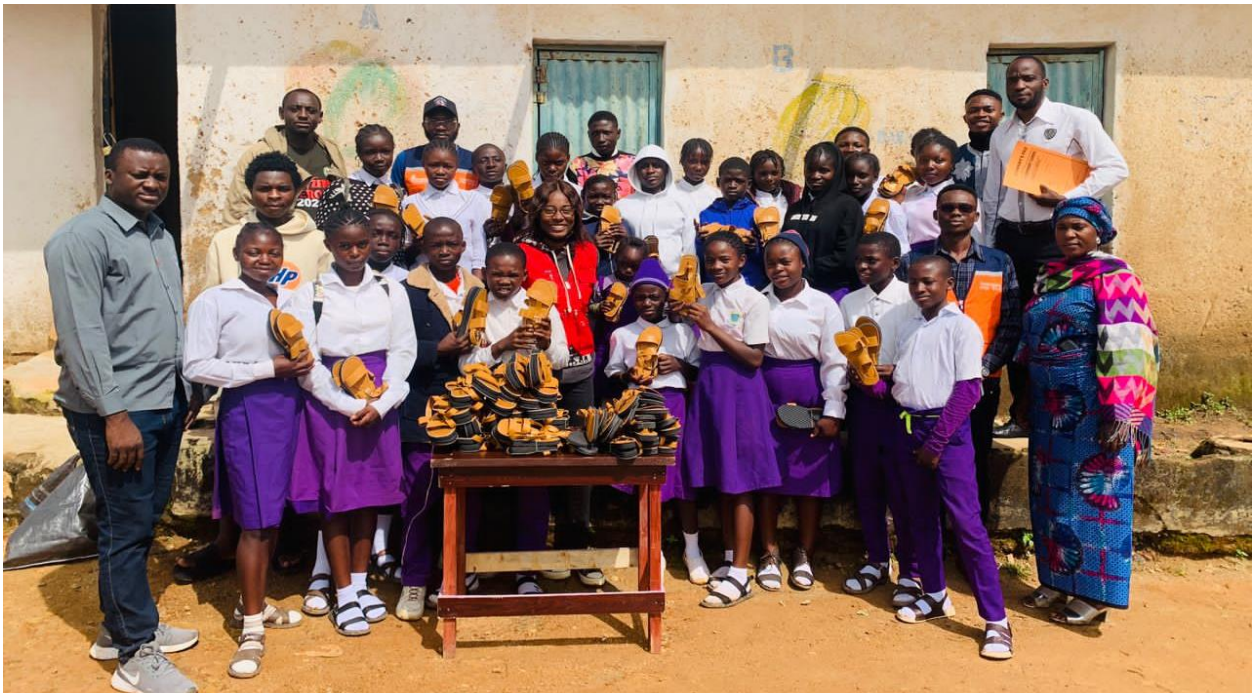
Fig 35-36: Images of the Shoes distributed on the 23 rd of September

On 23 rd September 2022, we collaborated with SD Shoes and Friends to give out free new school sandals to 100 children. We were able to provide sixty-six (66) shoes to students at COCIN Secondary School, Rankyeng, Gyel, and twenty (20) to a few children under the foundation, which is a total of eighty-two (82) shoes.