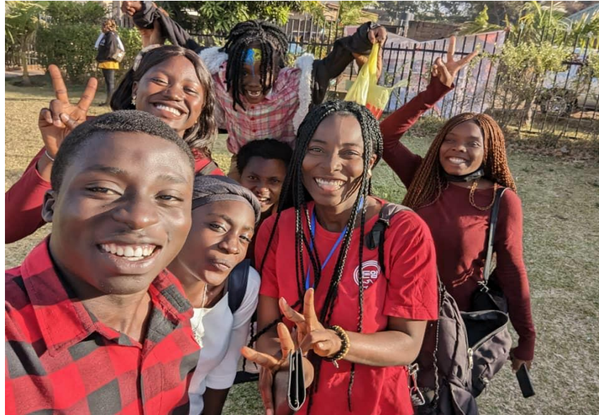
Fig 67: Image of the volunteers that were present as staff