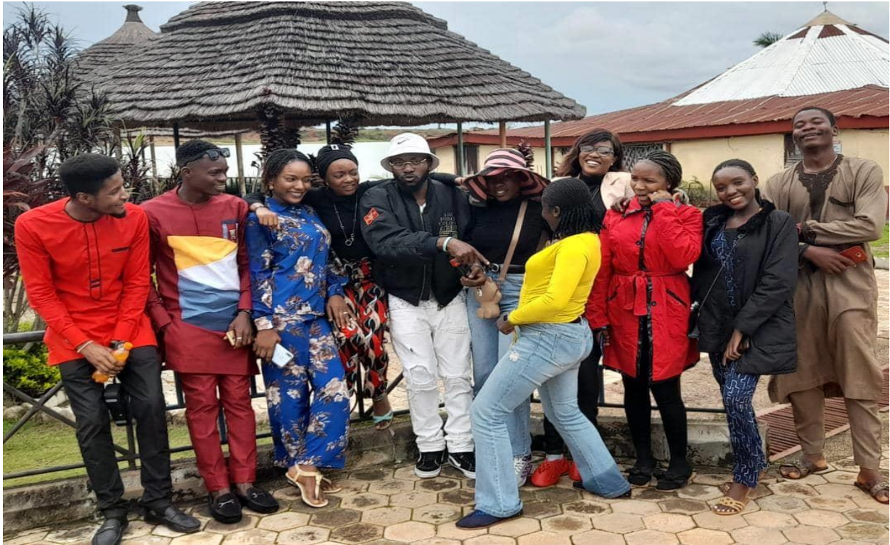
Fig 31-32: Images from Naza Agape at 4 celebrated on the 29 th of July