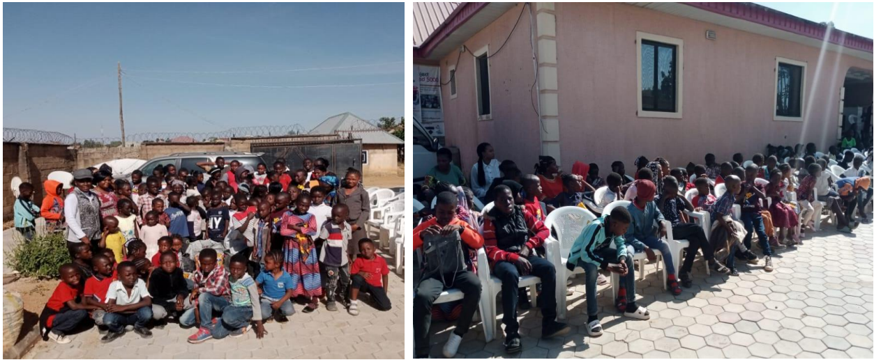
Fig 53-54: Images from the Week of the Young held on the 23 rd of November

individually, and also patriotic citizens of their various communities, state, and nation at large. There were eighty (80) children in attendance and gift packages and refreshments were shared at the end of the program.