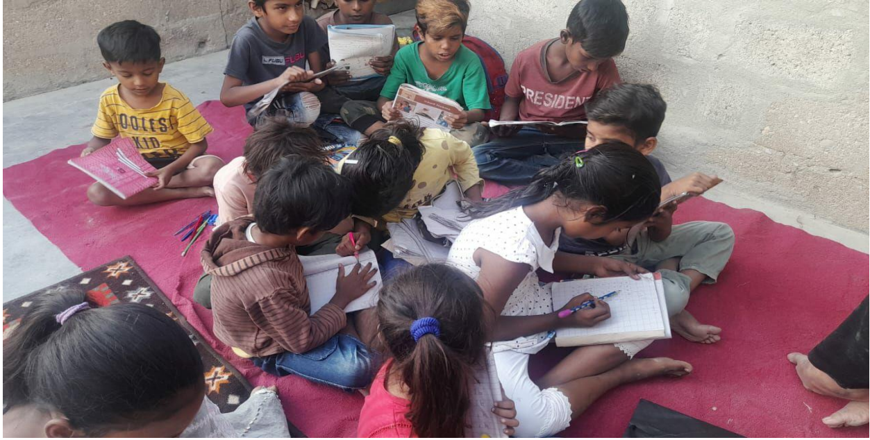
Fig 55-56: Images of the children in Pakistan