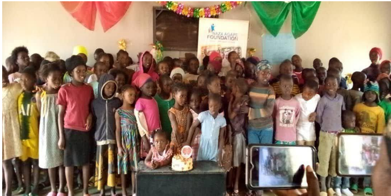
Fig 4-5: Images from the Valentine Special held on the 12 th of February

We donated clothes, pencils, packets of juice boxes, school bags, and handbags. To make the celebration more special we also baked a big cake for the children.