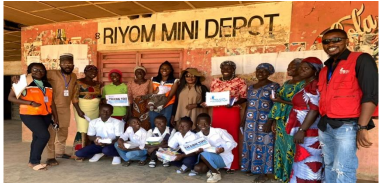
Fig 49-50: Images of the Widows and Orphan Support

We revisited the Riyom LGA to give financial support to six (6) widows for their businesses and paid the fees of five (5) students. We also gave these students a few educational stationaries like notebooks, pens, erasers, and pencils