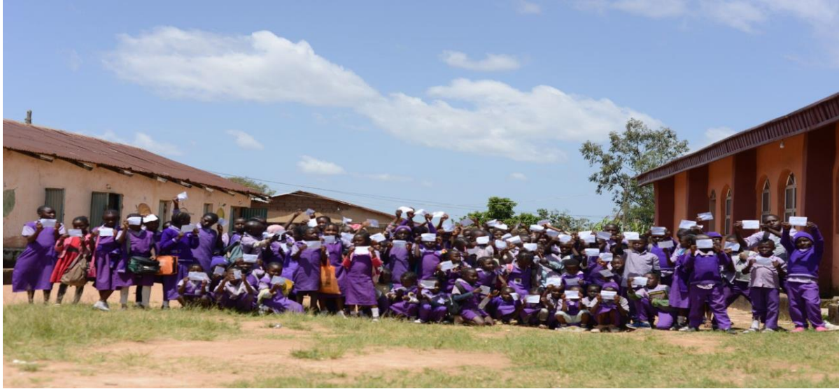
Fig 37-40: Images of children that had their fees paid