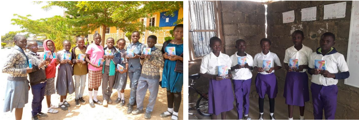
Fig 44-45: Images of some of the bibles donated and distributed

GATAB Project is aimed at giving out a minimum of 1000 bibles to 1000 teenagers who do not have a bible every year, and we have had the privilege of being part of the project in distributing these bibles across Nigeria. In 2022 we were able to distribute fifty-five (55) bibles from GATAB, and our Covenant University volunteers were able to distribute ten (10) that they had donated, making a total of sixty-five (65) bibles to the teenagers.