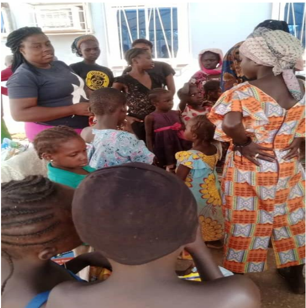
Fig 57-58: Images of the IDP Camp Outreach