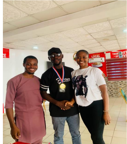
Fig 68-73: Images of the Volunteer's get-together from the Jos and Lagos Branch