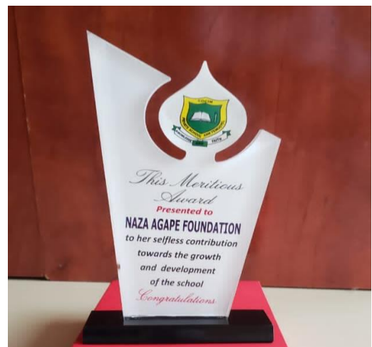
Fig 33-34: Images of Award received on the 6 th of August