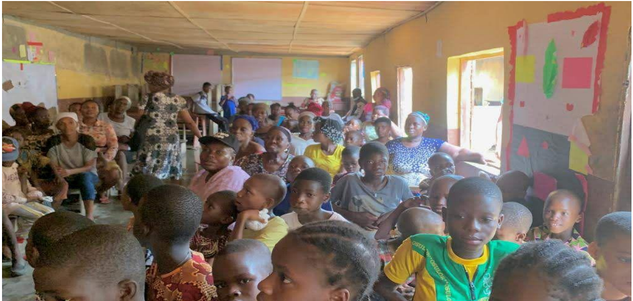
Fig 14-15: Images from the Project Feed 5000 held at Lagos Branch on the 14 th of May