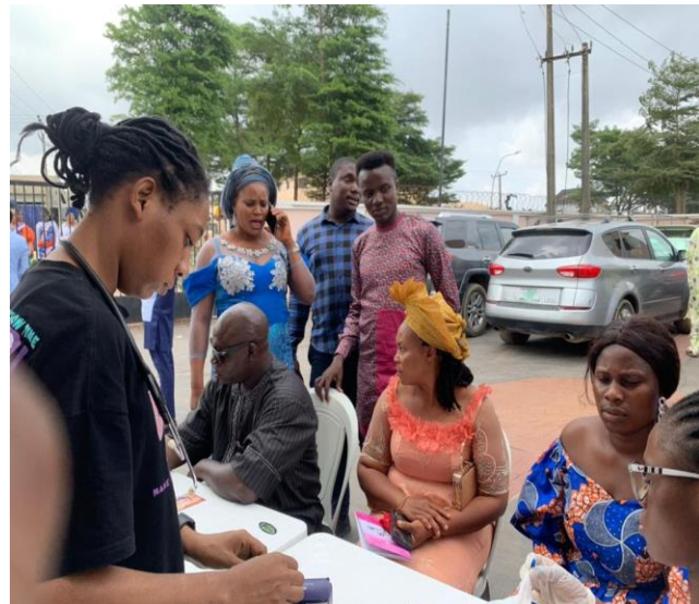
Fig 78 - 80: Images of our medical outreach in Lagos