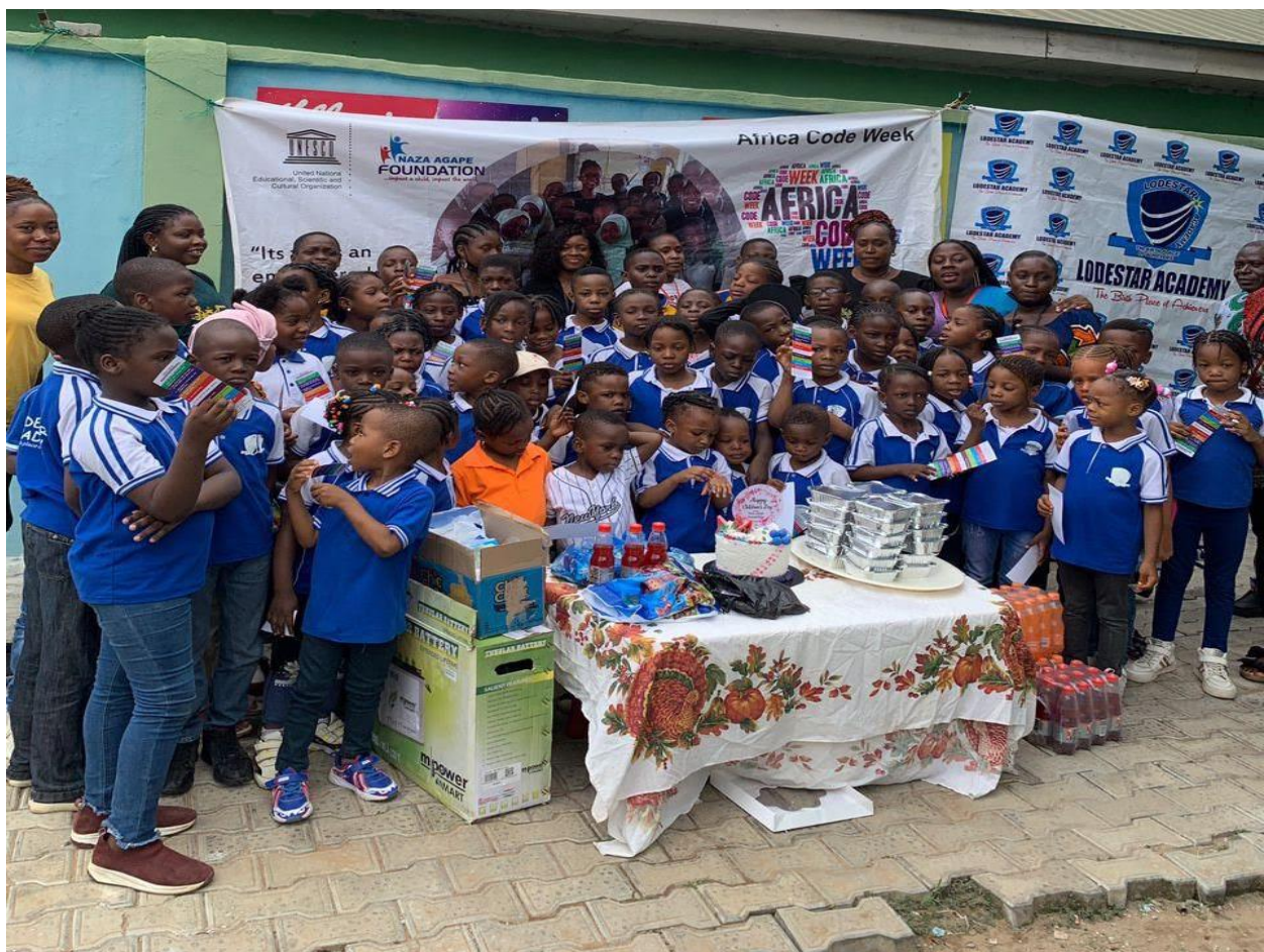
Fig 16-18: Images from the Children’s Day celebration held at Lagos and Jos Branches on the 27 th of May.