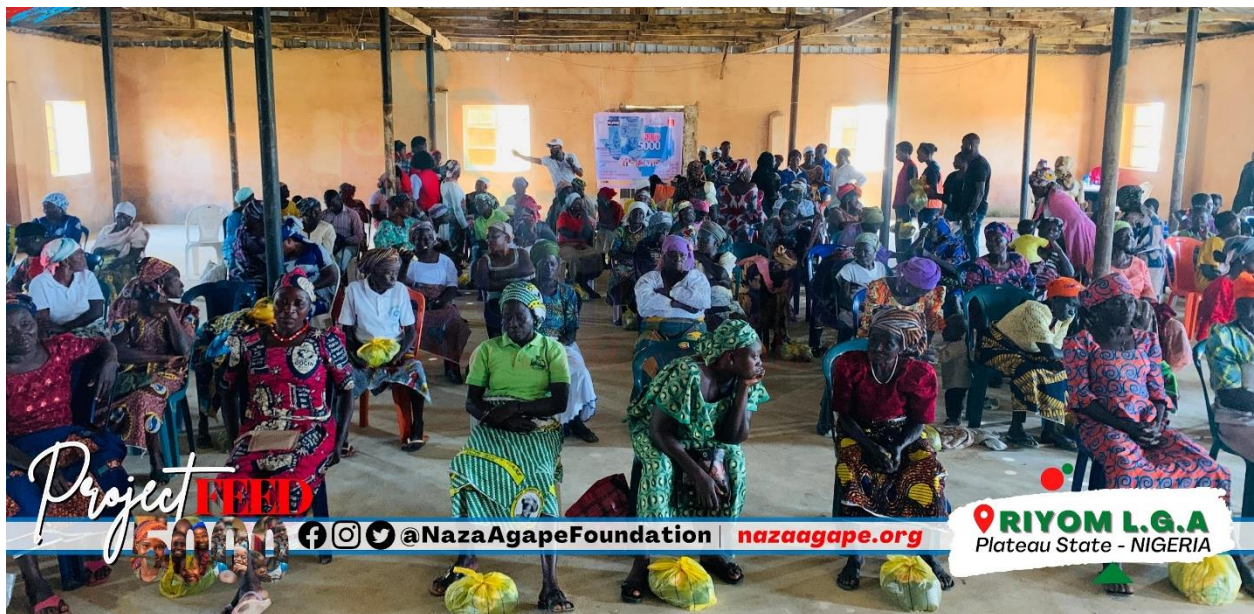
Fig 47-48: Images of the Project Feed 5000 held on the 21 st of October