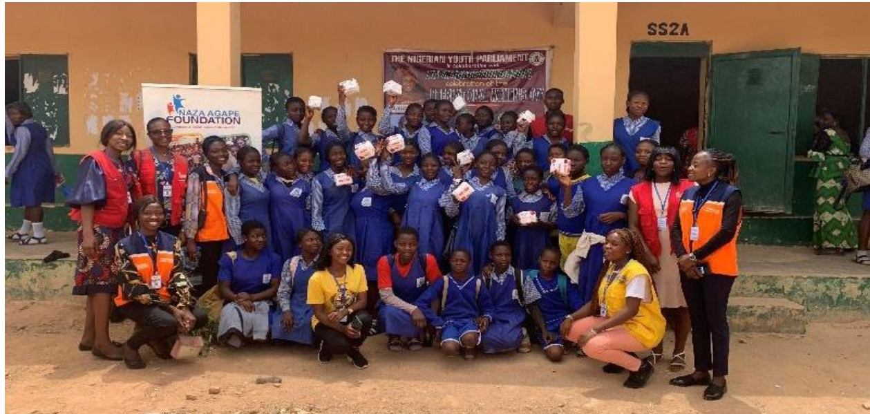
Fig 8-10: Images from the International Women's Day celebration held on the 11 th of March 2022

importance of the celebration of International Women’s Day (IWD2022). The theme for 2022 IWD was “Gender Equality Today for a Sustainable Tomorrow”. We also gave a little talk on feminine hygiene and menstrual health and handed out free pads to 35 girls out of the 100. The girls were taught how to use and dispose of these pads.