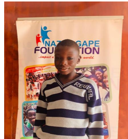
Fig 26-28: Images from our Back-to-School Campaign